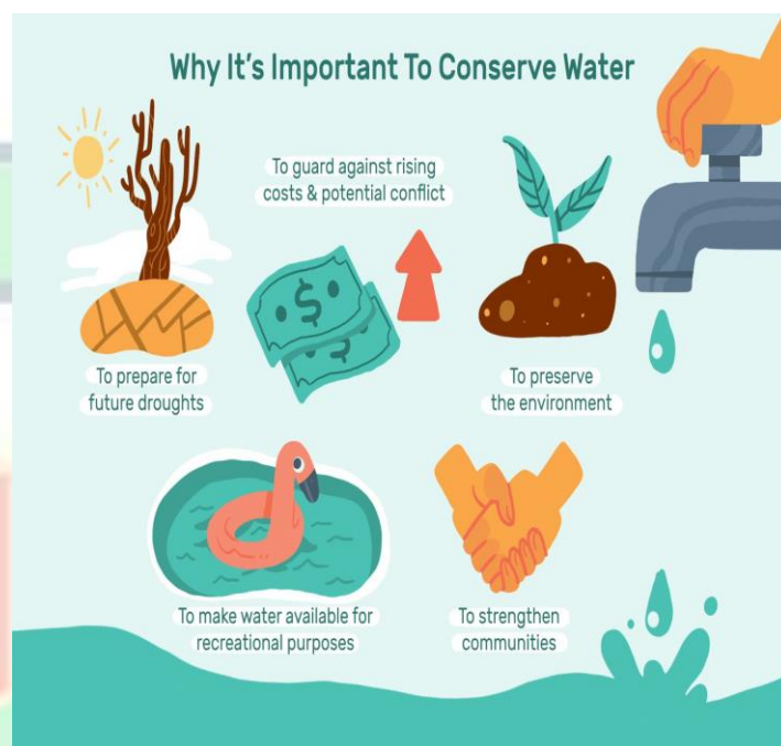
Figure 1: Conservation of Water

thus used to flush wastewater structures, wastewater treatment plants in agricultural business, and for breaking and sending soil and waste. Is. A satisfactory pile of new water has turned into a crucial position to ensure a monetary turn of events and reform. Since it takes 1000 tons of water to transport 1 ton of grain, the most appropriate way to get grain is to get water.